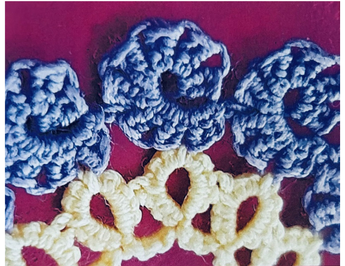
Left: Treble tatting stitch forming spiral rings.

In the second section of this book Ninetta explains a new stimulating technique. First she defines and dissects tatting movements. Then in wonderful full-color images she presents her treble tatting stitch (tds) with all its versatility.