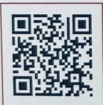
Video 3 - treble tatting - climbing round without cutting the thread]

A treble tatting stitch ring and special QR code to video tutorials.