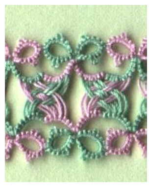
Interwoven picots by Riet

SR : Split ring FR : Floating ring Clr : Close ring 2 SHUTTLES